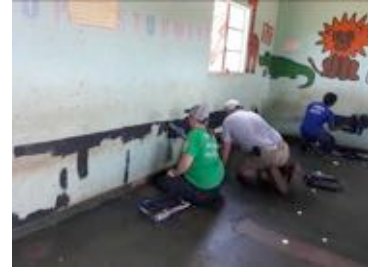
The Raymond Christian

Church team did a great job during the outreach to Phumelela preschool in making the school look new with fresh paint.